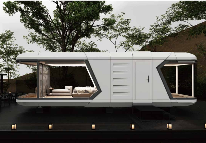
R9 CAPSULE HOUSE 27800 USD EXW PRICE/ ELEGANCE: *Customizable design* SIZE: 11500*3300*3300mm