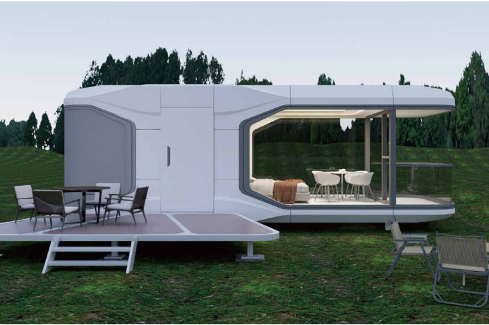
R6 CAPSULE HOUSE 16800 USD EXW PRICE/ ELEGANCE: *Customizable design* SIZE: 5800*3300*3300mm